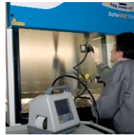
FILTER LEAKAGE TEST