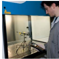
AIR FLOW SPEED TEST